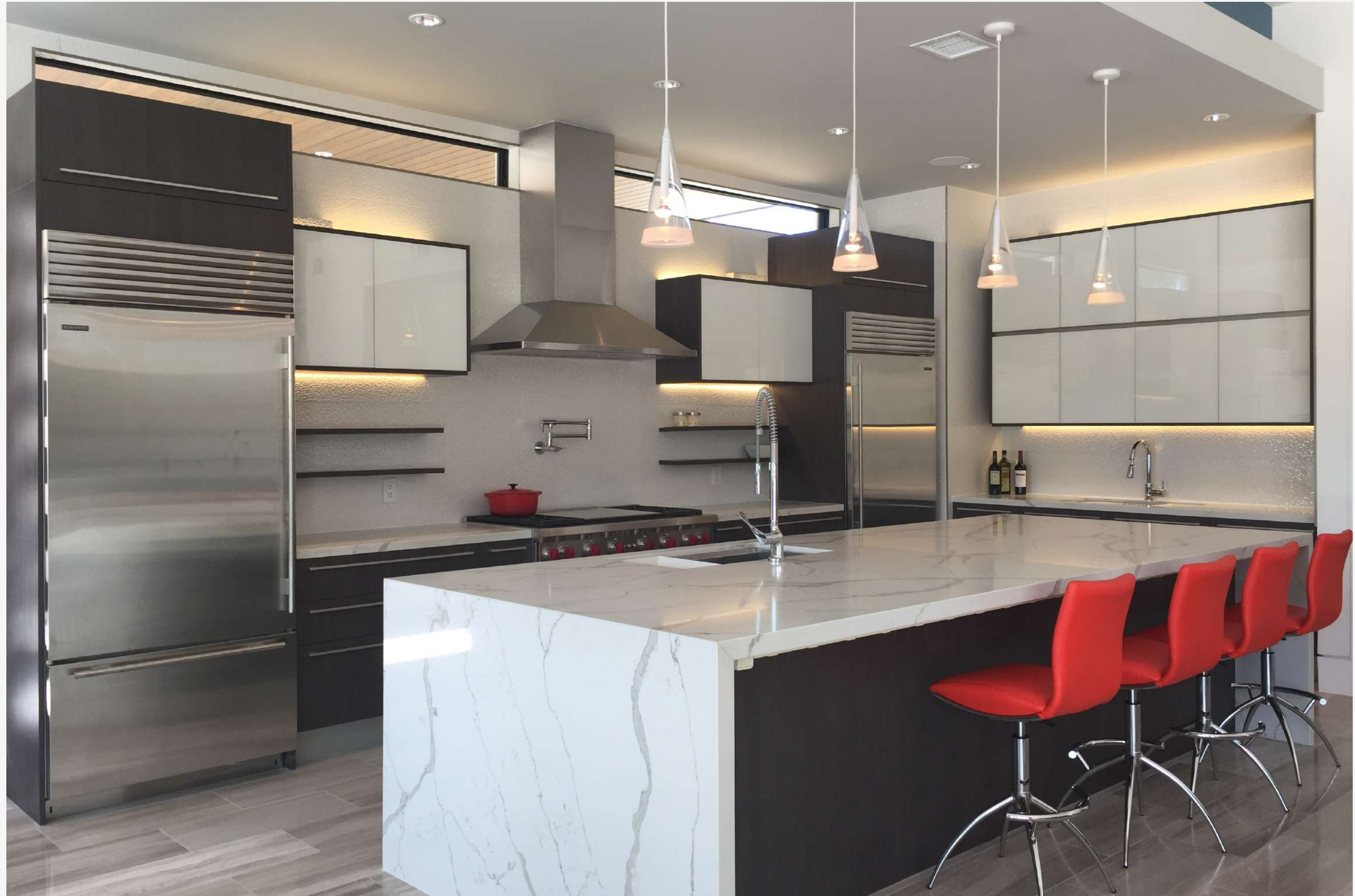
Hidden Cove Residence

Sugarland, TX Design, Products, and Installation Completion 2015