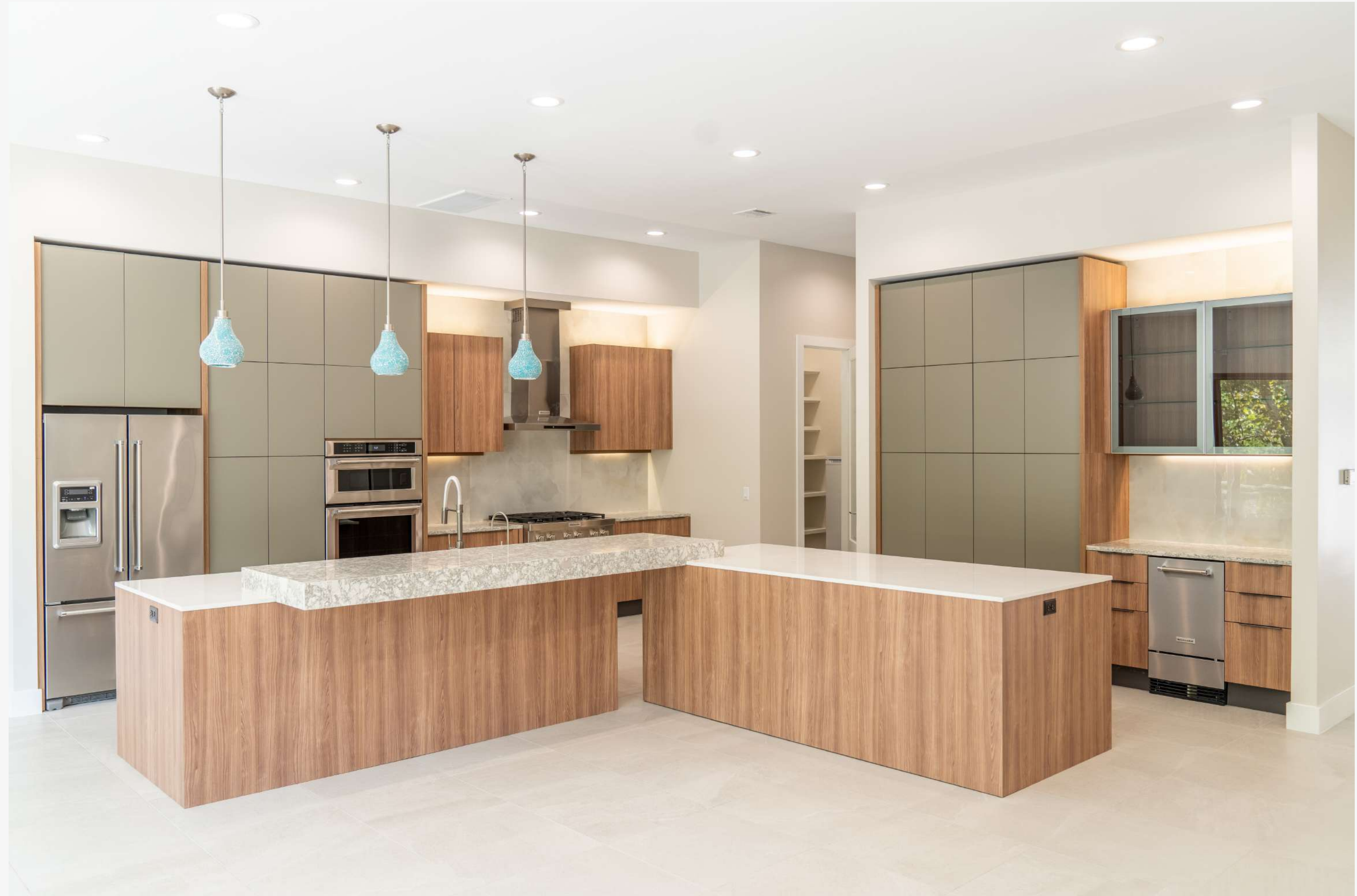
Farther Point Residence

Memorial, Houston Design, Products, and Installation Completion 2020